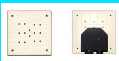
Lane deck plate 3274.631 set of 6 3274.632 set of 8 3274.633 set of 10