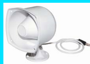
Internal loudspeaker 2850.736

The OSB9 is available in two versions, with or without the integral false-start detection system. The base and the top are to be the same for the two products, and it may be a simple solution if there are budget constraints to install the system without false-start detection, but at a later date to upgrade your system to include this facility.