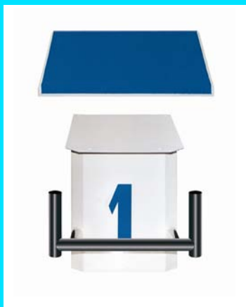
OSB9 Start block