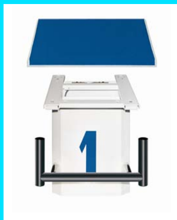
OSB9 Start block with Relay break detection